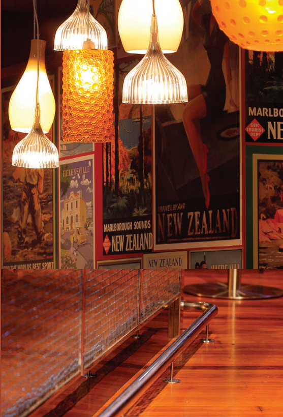
Corner Bar Hotel DeBrett

The Corner Bar at Hotel DeBrett has been a favourite drinking spot for city workers and weekend revellers for many years.