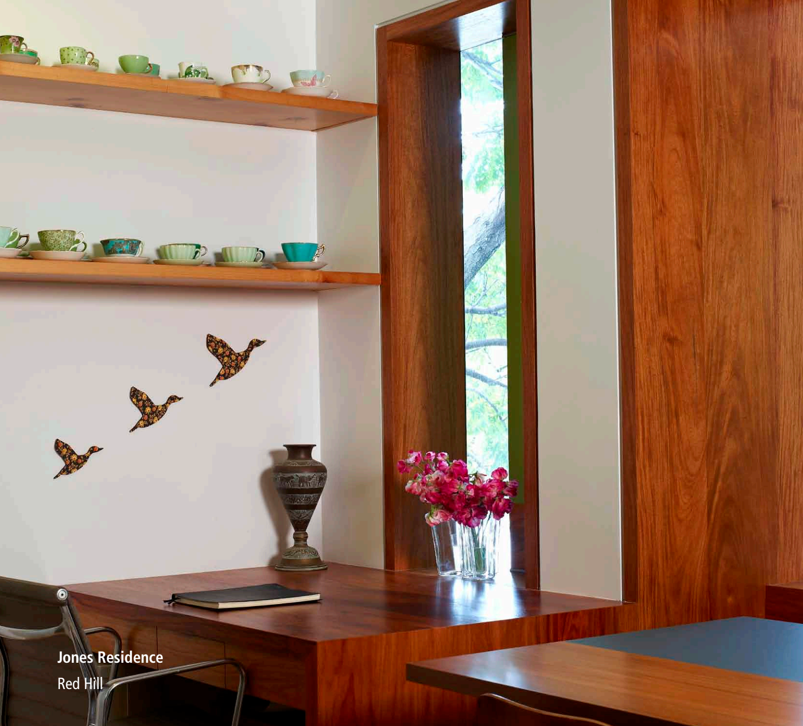
Jones Residence Red Hill

Jones Residence, Red Hill is a 'Stage One' addition to a small inner city 'Workers Cottage'. By rearranging circulation, removing an inefficient room and reinstating decking, consolidating functional zones this modest refurbishment provided a home with a light filled purposeful environment.