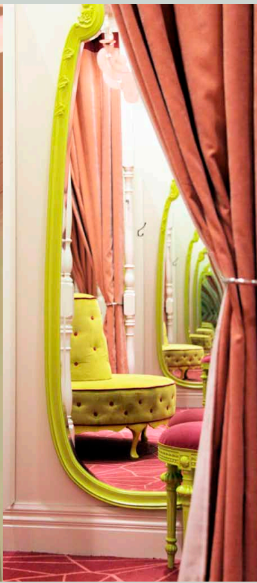
Resene Half Emerge