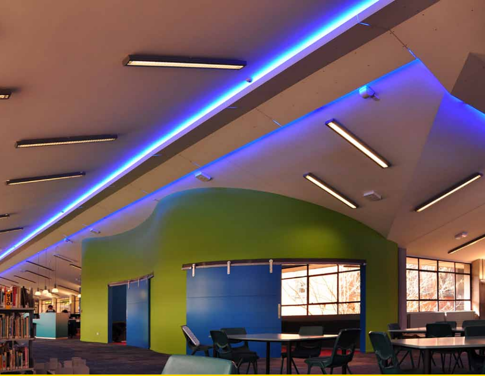
Resene Southern Cross