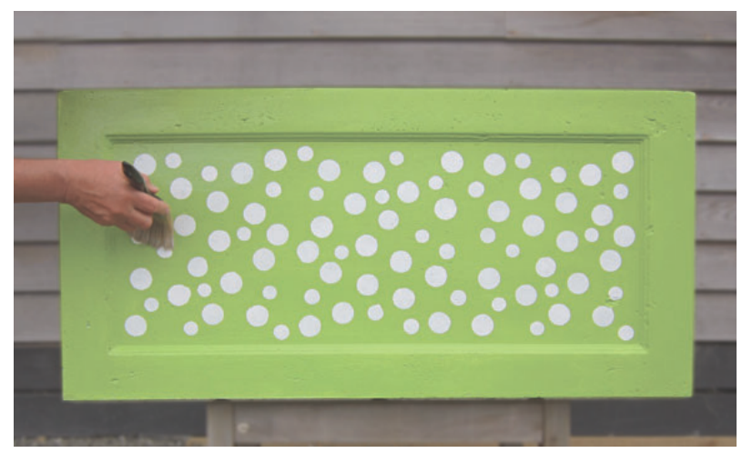
I followed my two options with two coats of Resene Multishield+ (I used satin, but this product also comes in gloss and matt) to give the paint protection from the weather.