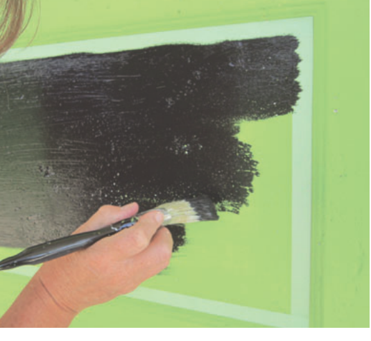
Option C: Resene also do a range of metallic paints, which give a different effect and would look amazing in the right situation. This should be applied carefully with a brush or roller.