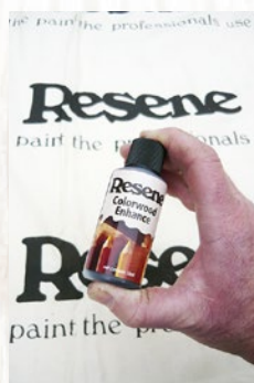
Step three Shake the Resene Colorwood Enhance.