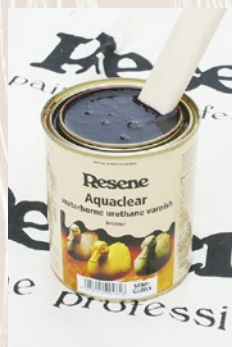
Step five Carefully stir the Resene Colorwood Enhance into the Resene Aquaclear until it's evenly dispersed.