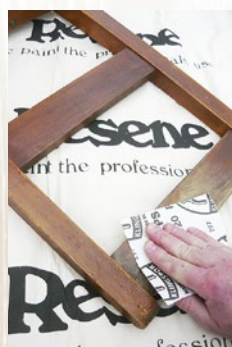
Step one Lightly sand the chair to 'key' the surface.