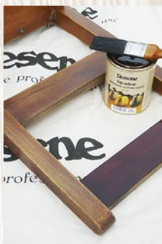
Step six Apply one coat of the coloured Resene Aquaclear to the chair, brushing in the direction of the grain, and allow to dry.