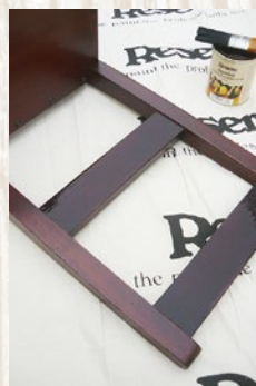
Step seven Apply a second coat of the coloured Resene Aquaclear to the chair, brushing in the direction of the grain, and allow to dry.