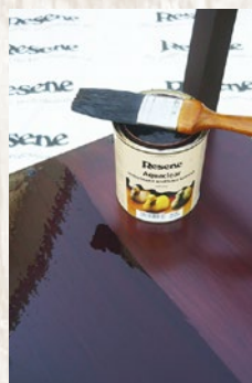
Step eight Apply a third coat of the coloured Resene Aquaclear to the chair, brushing in the direction of the grain, and allow to dry.

To get the look: Mark painted the background wall with Resene SpaceCote Flat tinted to Resene Rice Cake.