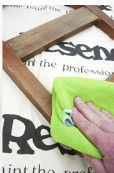
Step two Wipe off any sanding residue with a clean cloth.