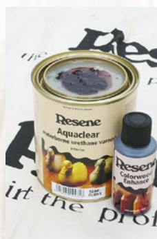
Step four Pour the Resene Colorwood Enhance into the Resene Aquaclear.