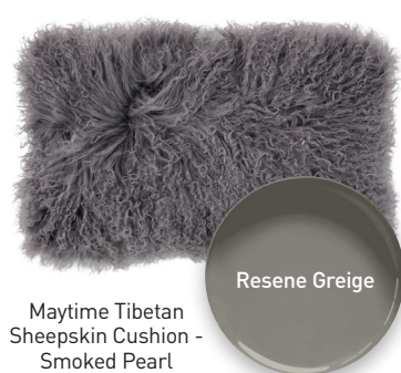
Maytime Tibetan Sheepskin Cushion - Smoked Pearl