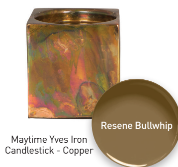
Maytime Yves Iron Candlestick - Copper