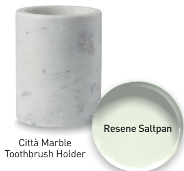
Città Marble Toothbrush Holder