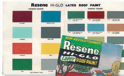
Above: An early Resene colour chart.

To reinforce this position, Resene joined the Environmental Choice programme in 1996, making it easier for consumers to select paints that ease the burden on the environment.