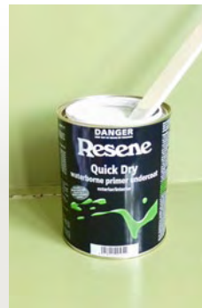
Step four Carefully stir the Resene Quick Dry.