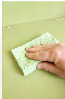
Step three Wipe off any sanding residue with a damp sponge and allow surface to dry.