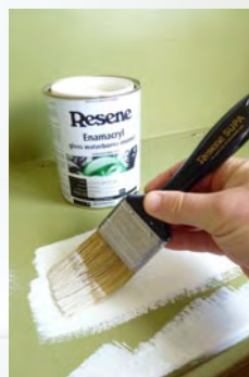
Step seven Apply one coat of Resene Lime White to the bench seat and allow two hours to dry.