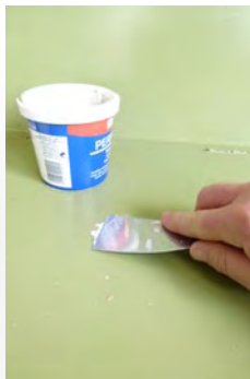
Step one Fill any holes with wood filler and allow to dry.