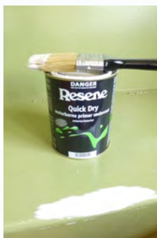
Step five Spot prime any filler and areas of bare wood with Resene Quick Dry. Allow two hours to dry.