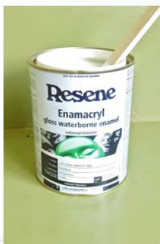
Step six Carefully stir the Resene Enamacryl.