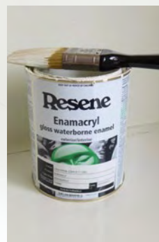
Step eight Apply a second coat of Resene Lime White to the bench seat and allow two hours to dry.

Turn a plain bench seat into a cool contemporary feature with a little bit of help from Resene.