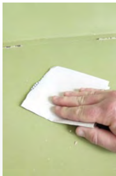
Step two Sand the filler smooth and then lightly sand the entire bench to 'key' the surface.