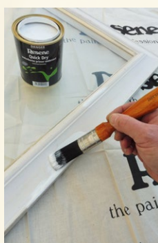
Step three Spot prime any areas of bare wood with Resene Quick Dry and allow two hours to dry.