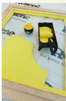
Step six Paint the remainder of the glass with Resene Wild Thing using the testpot roller. Allow to dry.