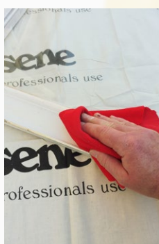
Step two Wipe off any sanding residue with a clean cloth.