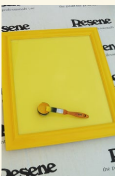
Step eight Turn the frame and glass over and paint the frame with two coats of Resene Galliano, allowing two hours for each coat to dry.