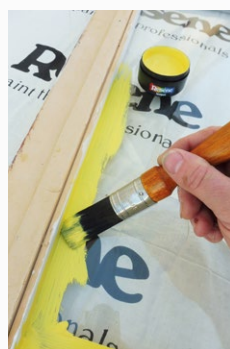
Step five Turn the frame and glass over so it's face down and cut in around the edge of the glass with Resene Wild Thing.