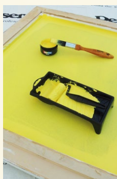
Step seven Apply a second coat of Resene Wild Thing to the glass and allow to dry.