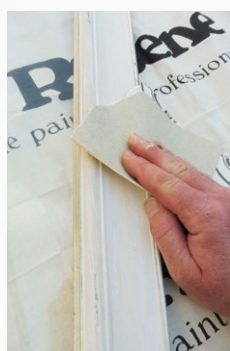
Step one Lightly sand the picture frame to 'key' the surface.