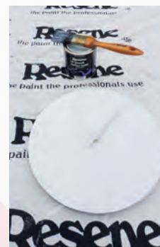
Step four Apply one coat of Resene Waterborne Smooth Surface Sealer to the clock face and allow to dry.