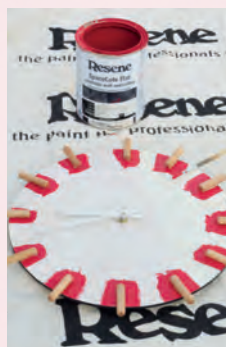
Step seven Use an artists' brush to carefully 'cut in' around the furniture dowels using Resene Shiraz.