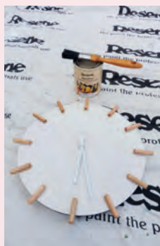
Step six Apply two coats of Resene Aquaclear to the wooden furniture dowels, allowing two hours for each coat to dry.