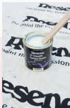
Step three Carefully stir the Resene Waterborne Smooth Surface Sealer.