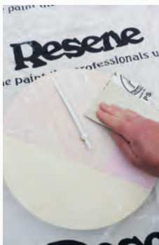
Step one Lightly sand the clock face to 'key' the surface.