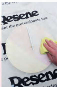
Step two Wipe off any sanding residue with a clean cloth.