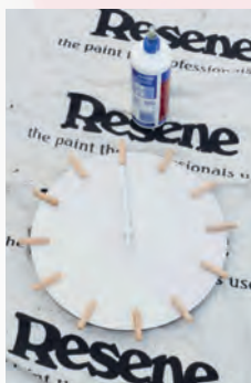
Step five Carefully glue the wooden furniture dowels around the clock face, as shown, to form 'numbers'. Allow glue to dry.