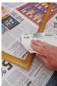
Step one Lightly sand the picture frame to provide a 'key'.