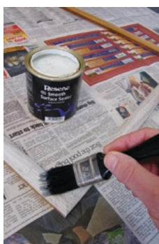
Step two Apply one coat of Resene Waterborne Smooth Surface Sealer to the picture frame and allow two hours to dry.