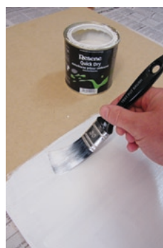
Step three Apply one coat of Resene Quick Dry to the piece of MDF and allow two hours to dry. Fix the piece of MDF into the picture frame with PVA glue and allow to dry.