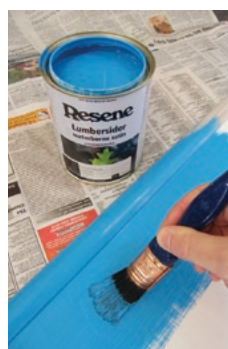
Step four Apply two coats of Resene Bowie to the MDF and picture frame, allowing two hours for each coat to dry.