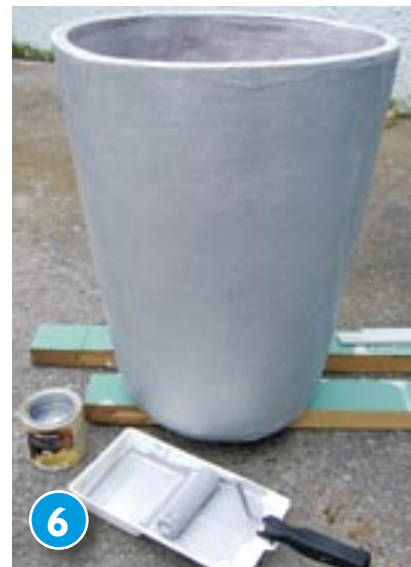
6 Stir the Resene Enamacryl Metallic paint with a flat wooden stirrer and apply two coats to the pot using a small paint roller and tray, allowing two hours to dry after each coat.