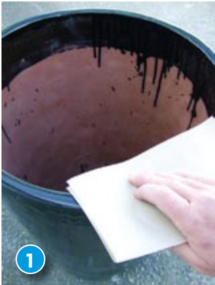
1 Sand the glazed surface of the pot with sandpaper to provide a key. Following manufacturer's instructions, seal the inside of the pot with terracotta sealer and allow to dry.