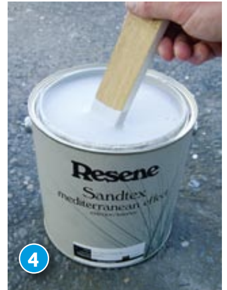
4 Carefully stir the Resene Sandtex with a flat wooden stirrer.