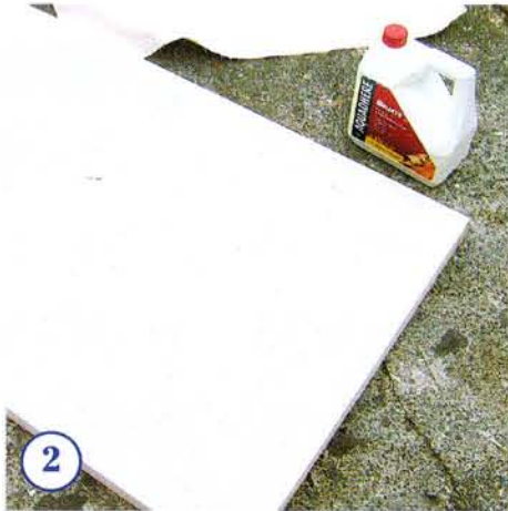
2 GLUE the canvas to the plywood panel with a thick layer of PVA glue. Allow to dry.

Handy hint: THERE'S no need to make the flowers look realistic. Use bold brushstrokes and, if you make a mistake, just paint over it.