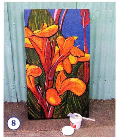
8 SOFTEN the black around the leaves with Black Forest and build up the lilies with the following: Trinidad, Lightning Yellow, Sun. Apply highlights to the stalks with Can Can. Paint the sky Deep Koamaru, allowing a little of the basecoat to show through. Paint the side edges of the panel with Nero. Allow to dry then coat the entire panel, front and back, with two coats of Resene Multishield Gloss.