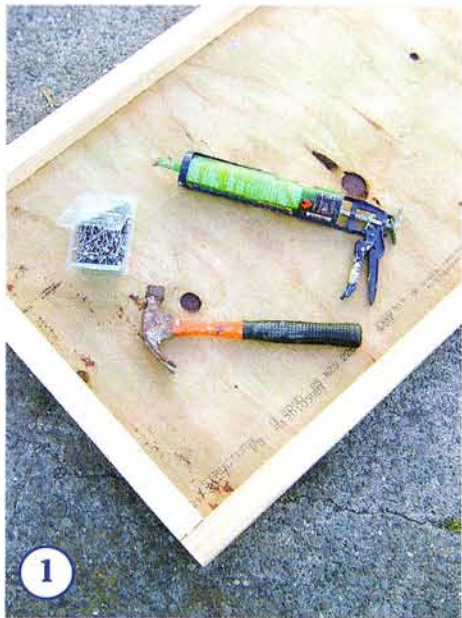
1 CUT the 50mm x 50mm timber to make a backing frame flush with the edges of the plywood panel. Fix with construction glue and galvanised nails. Allow to dry.