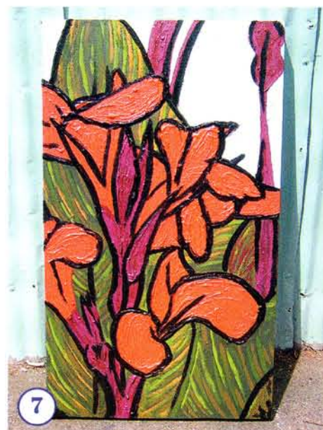
7 FILL in the outline of the leaves, stalks and flowers with Nero. Allow to dry.