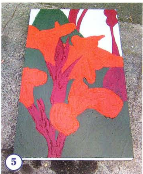
5 AS a basecoat, apply Guardsman Red to the lilies, Black Forest to the leaves, Persian Red to the stalks, and Anakiwa to the sky. Leave to dry.