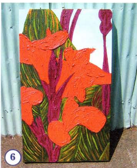
6 FILL in the detail using the following colours. Leaf stripes: Madras, Turtle Green, Fiji Green, Trinidad. Stalks: Hot Chile, Mulberry.