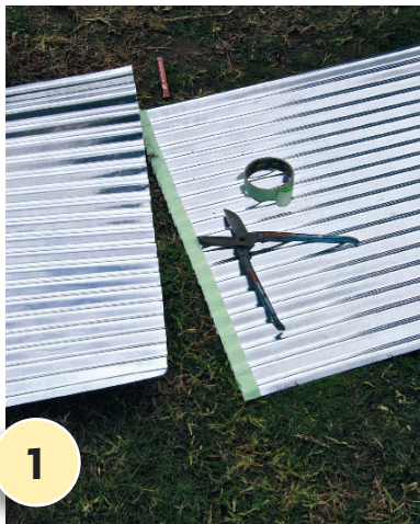
1 Measure, mark and cut a 640mm strip from one end of the zincalume panel. From the smaller, cut piece of panel, cut a strip for the sea, two triangles for sails, the boat hull and a circle for the sun.