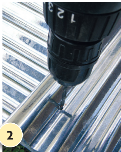
2 Smooth rough edges with a metal file. Position the sea along the bottom of the larger panel and drill a pilot hole (where two ridges meet), as shown.