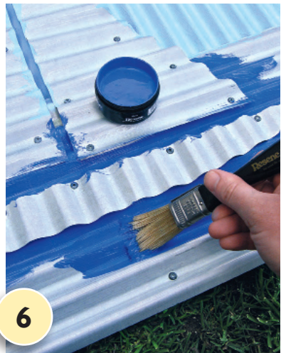
6 Paint the sky with two coats of Resene Torea Bay and the sea with two coats of Resene Alabaster, allowing two hours for each coat of paint to dry.