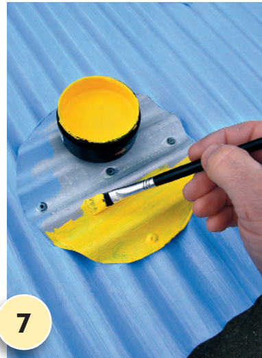
7 Paint the sun with two coats of Resene Supernova, allowing two hours for each coat to dry.