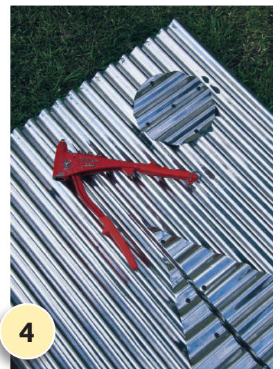
4 Repeat steps two and three with the remaining pieces of zincalume.