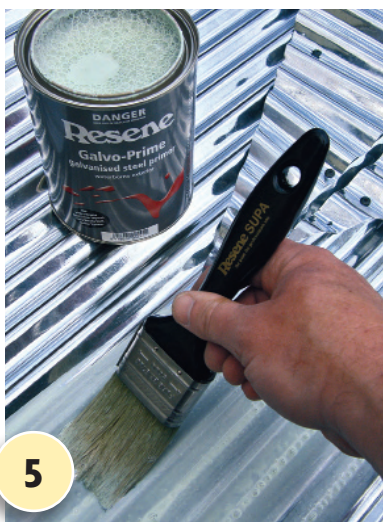
5 Apply one coat of Resene Galvo-Prime to the panel and allow it to dry.