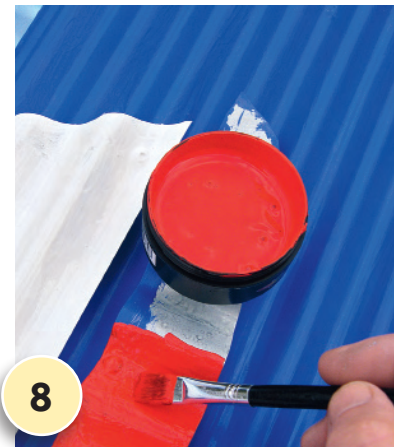
8 Paint the sails with two coats of Resene Alabaster and the hull with two coats of Resene Bright Red. Allow each coat two hours to dry. Fix the sails to the fence panel with stainless steel screws. Spot prime and paint screw heads.