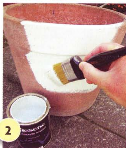
2 Apply one coat of Resene Concrete Primer to the pot, allowing two hours to dry.