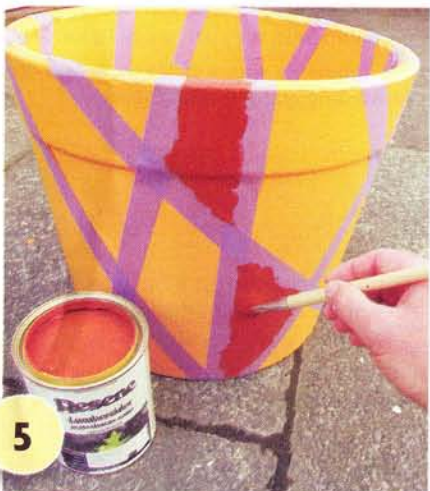
5 Paint alternate shapes with two coats of Resene Desperado, allowing two hours for the first coat to dry.