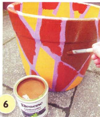
6 Paint remaining shapes with two coats of Resene Milk Chocolate, allowing two hours for the first coat to dry.