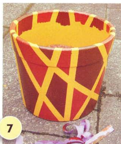
7 Before the second coat of each colour has dried, carefully remove the masking tape and allow paint two hours to dry.