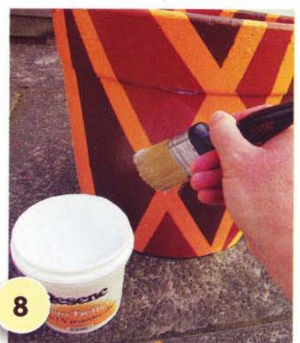
8 Apply a coat of Resene Sun Defier and allow two hours to dry before planting up with potted colour.