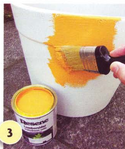
3 Apply two coats of Resene Flashback to the pot, allowing two hours for each coat to dry.