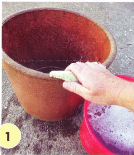
1 Wash the concrete pot with warm soapy water and rinse well. Allow to dry.

* You can decorate a terracotta pot in the same way but you should use Resene Terracotta Sealer instead of Resene Concrete Primer in step 2.