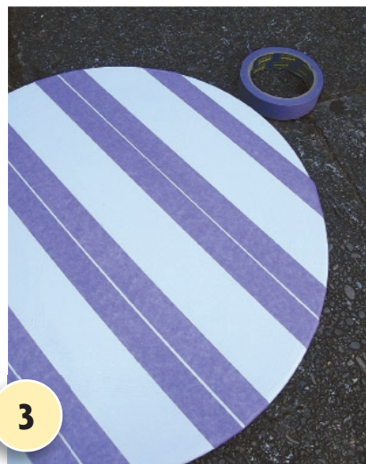
3 Measure and mask off 50mm strips across the lazy Susan, as shown.