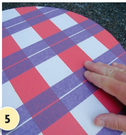
5 Once the second coat of Resene Mandy is all dry, repeat step 3, masking off 50mm strips perpendicular to the first set, as shown.