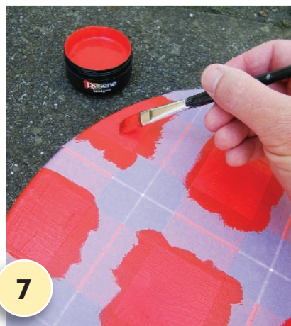
7 Mask off the squares where the pink lines intersect and paint them with two coats of Resene Bright Red. Again give the first coat two hours to dry but remove the tape before the second coat dries.