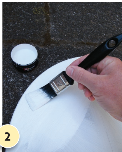
2 Apply two coats of Resene Alabaster to the lazy Susan, allowing two hours for each coat to dry.