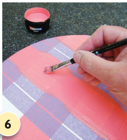
6 Paint the masked white areas with two coats of Resene Mandy, as shown. Again, allow the first coat two hours to dry but remove the tape before the second coat dries. Then leave to dry.