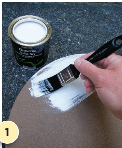
1 Apply one coat of Resene Quick Dry to the lazy Susan and allow two hours to dry.

For more on paints phone 0800 RESENE (0800 737 363) or visit www.resene.co.nz