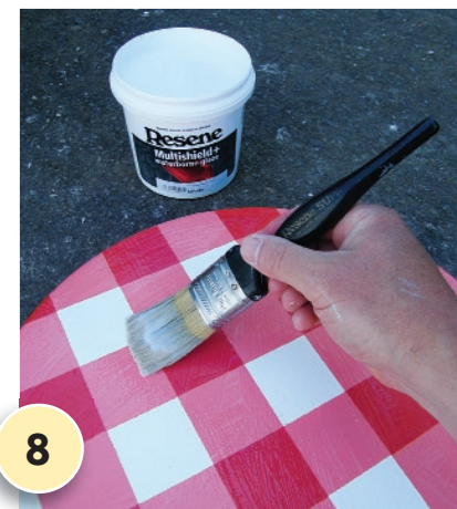
8 When all the paint is thoroughly dry, apply three coats of Resene Multishield+ gloss to the lazy Susan, allowing two hours for each coat to dry.