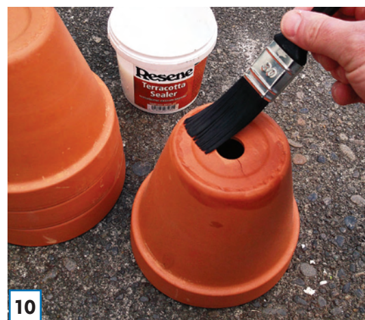
10 Seal the terracotta pots inside and out with Resene Terracotta Sealer and allow to dry.