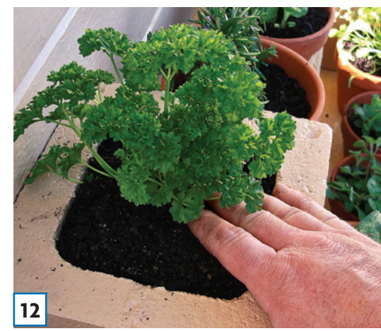
12 Fill the end blocks with good quality potting mix and plant each one of these with a herb as well.