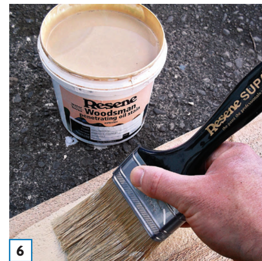
6 Apply one coat of Resene Waterborne Woodsman (in Resene Uluru) to three of the pieces of fence paling. Allow 24 hours to dry and then apply a second coat.