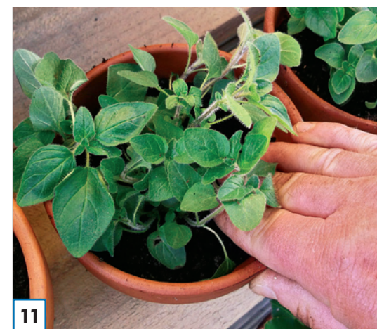
11 Fill the terracotta pots with good quality potting mix and plant each one with a herb.