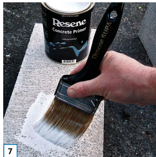
7 Apply one coat of Resene Concrete Primer to the concrete blocks and allow two hours to dry.