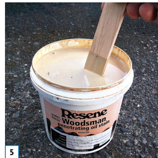
5 Carefully stir the Resene Waterborne Woodsman with a paint stirrer.