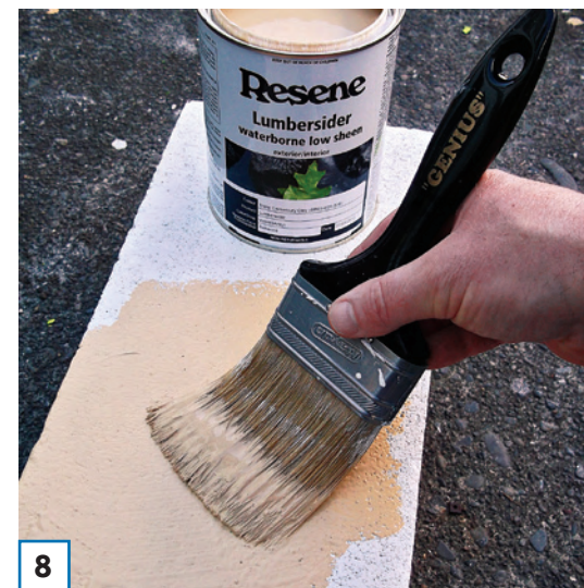
8 Apply two coats of Resene Triple Canterbury Clay to the concrete blocks, allowing two hours for each coat to dry.