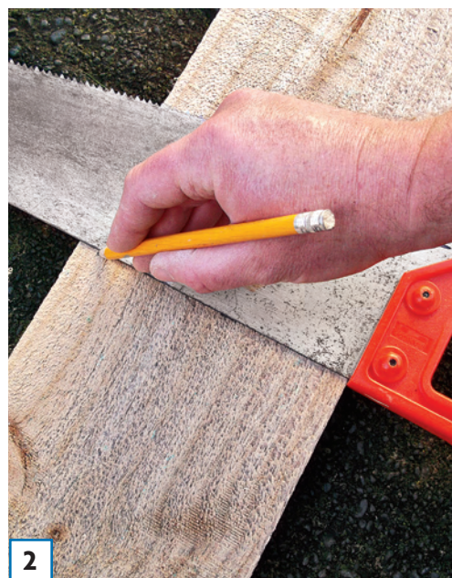
2 Mark a 90-degree line using the back of the saw or a set square.