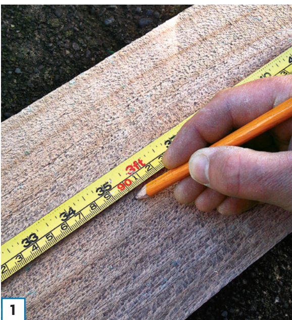
1 Mark the halfway point on each of the fence palings (900mm).