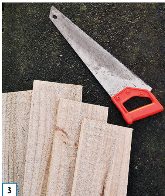
3 Using the pencil line as a guide, cut each fence paling in half.