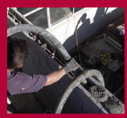
Pumping PaintCrete into trial wall one.