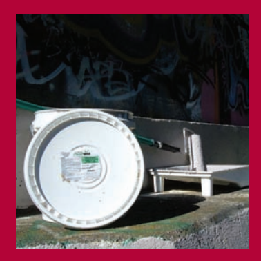
Resene grey recycled EchoPaint.