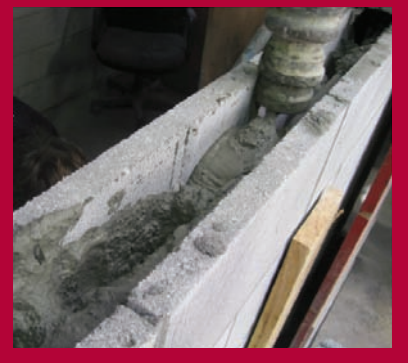
Pumping PaintCrete into trial wall two.