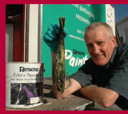
A can before and after Resene PaintWise processing.