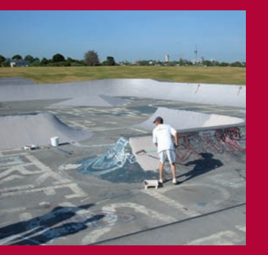
no match for Resene grey recycled EchoPaint.