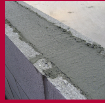
PaintCrete after being levelled off at the top surface of the wall.