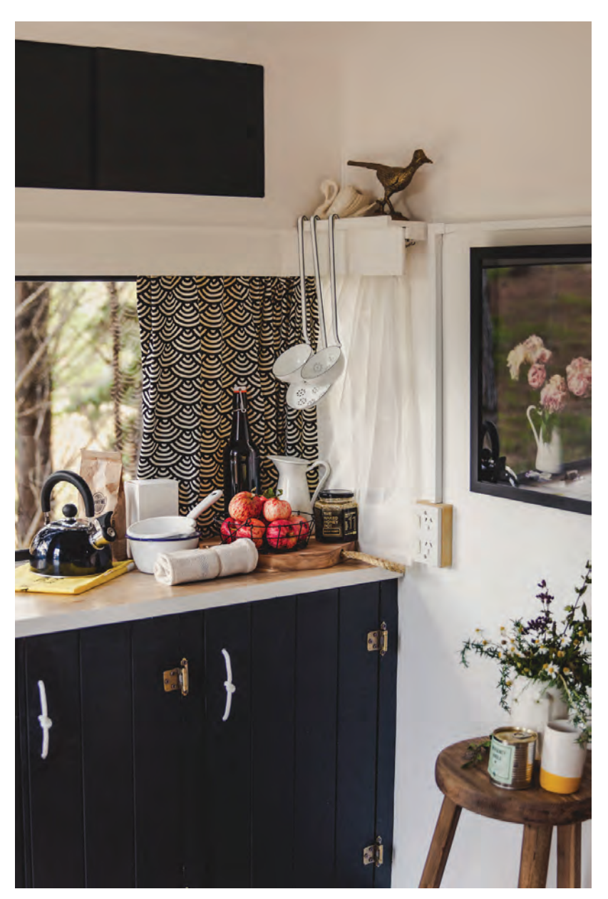
CABINETRY With its rope handles the cabinetry has a fun holiday feel, while being held together by solid brass fixtures. Father Rabbit's enamel falconware is prepared for the knocks of the road.

level of craftsmanship required. "Not one job in the interior was as simple as it seemed on paper. The details of the kitchen in particular played on my mind," says Clancy. Meanwhile, Heather took the reins when it came to deciding the aesthetics. She was determined to re-do the space in a modern, clean and minimal way, with a monochromatic colour scheme and gold accents. "We wanted to make it a small home with all the things we love, like clean lines and wooden finishes – none of the kitsch retro vibe or brown and oranges that a lot of other classic Kiwi caravans have been restored with," says Heather.