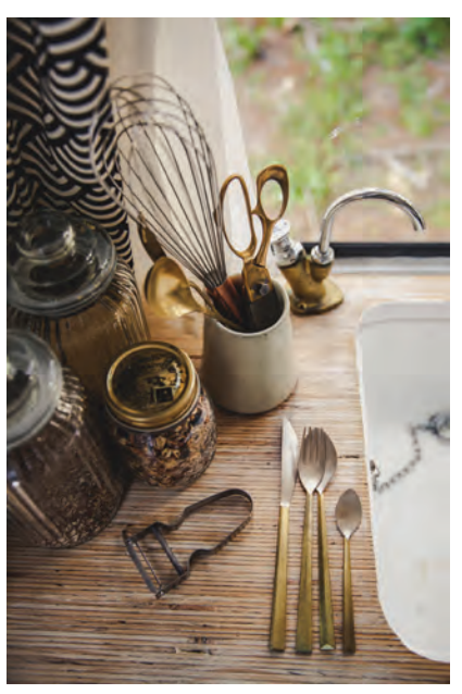
COUNTERTOP The LVL ply countertop and table was limed with a coat of white paint, lightly sanded and then drowned in waterproof polyurethane. Douglas and Bec cutlery and ceramics accentuate the brass used throughout the rest of the cabin.

Now featuring bold cabinetry, striking materials and clean-line furnishings, Clancy and Heather are at the stage where they can fill their caravan with everything that makes them smile: good books, good food, treasures picked up along their journeys and, of course, those very helpful friends. ■