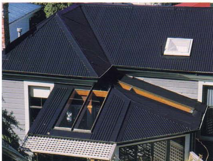
Roof: Resene Blue Whale

Use Resene Membrane Roofing Primer for all sheet rubber roofing systems and for unsurpassed adhesion on bituminous surfaces. See Data Sheet D49.