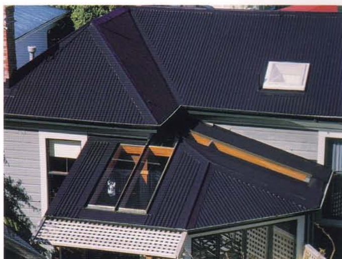
Roof: Resene Blue Whale