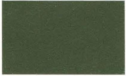
* METALLIC GREEN