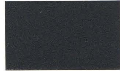
* BRIGHT CHARCOAL