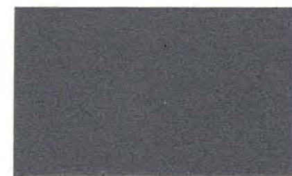
* BRIGHT GREY