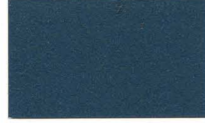
* SILVER BLUE