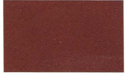
* METALLIC COPPER