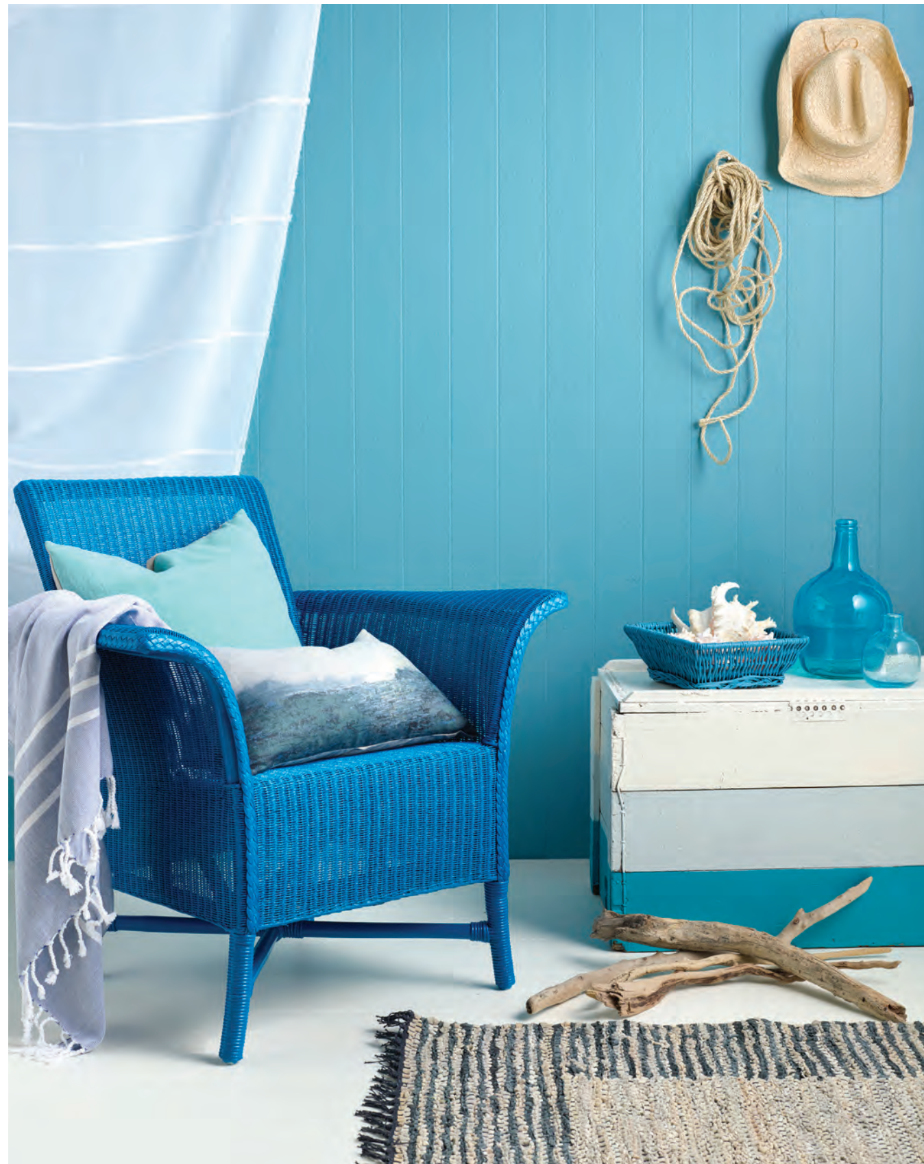
RESENE HALF KUMUTOTO RESENE THE RANGE FASHION COLOURS

Paints and colours available from Resene ColorShops nationwide Ph 0800 RESENE (737 363) resene.co.nz/colorshops