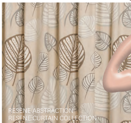
RESENE ABSTRACTION RESENE CURTAIN COLLECTION