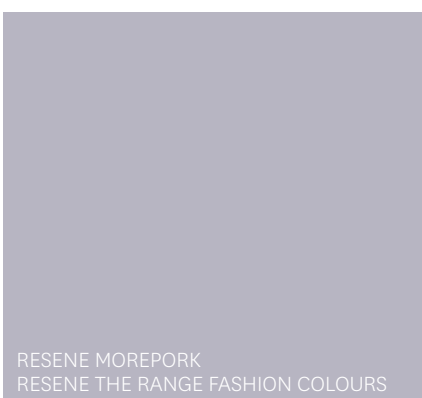
RESENE MOREPORK RESENE THE RANGE FASHION COLOURS