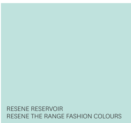
RESENE RESERVOIR RESENE THE RANGE FASHION COLOURS