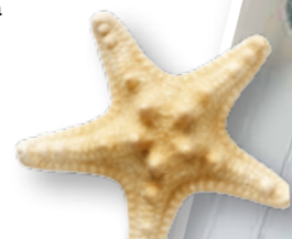
STYLING CLAUDIA KOZUB