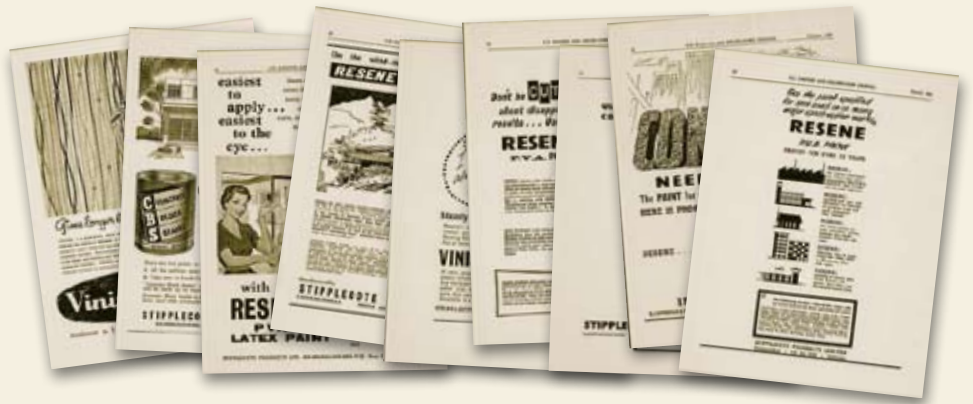
Above A series of early advertisements showing the benefits of innovative Resene waterborne paints.