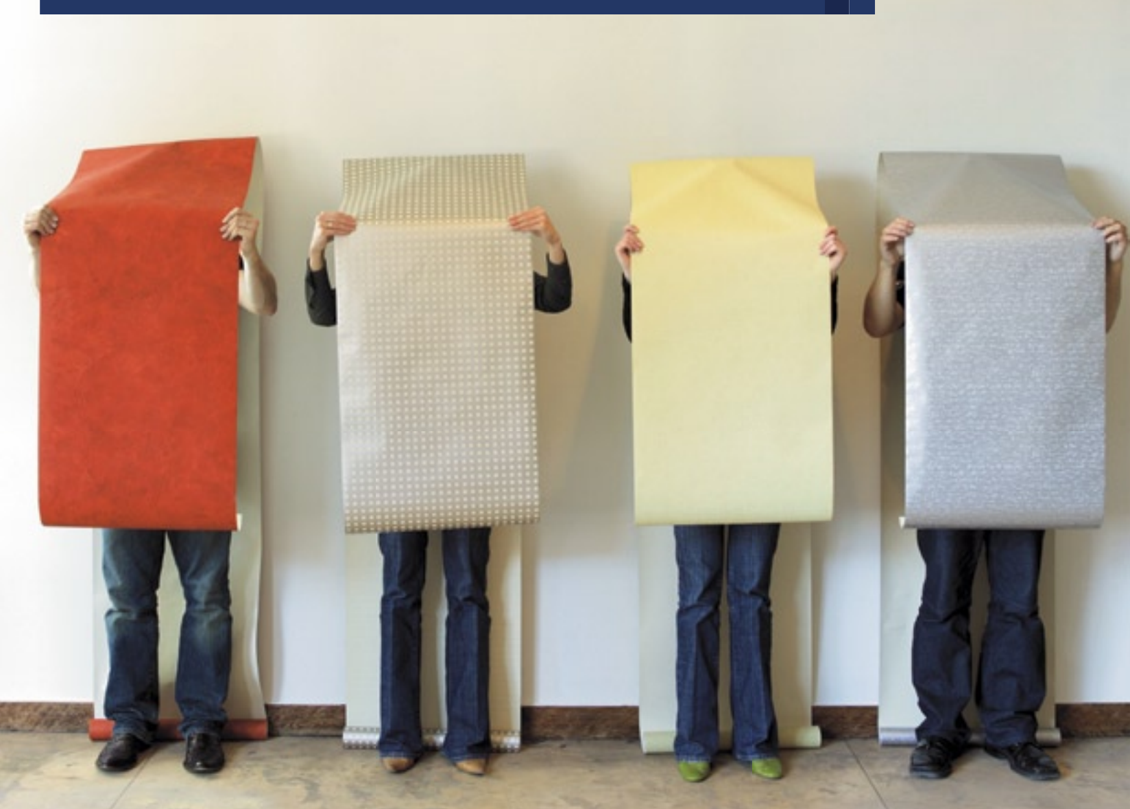
From left: 20718 Textures, 21126 Hip-n-Square, 21099 Hip-n-Square, 47080 Resene Textures and Colours.