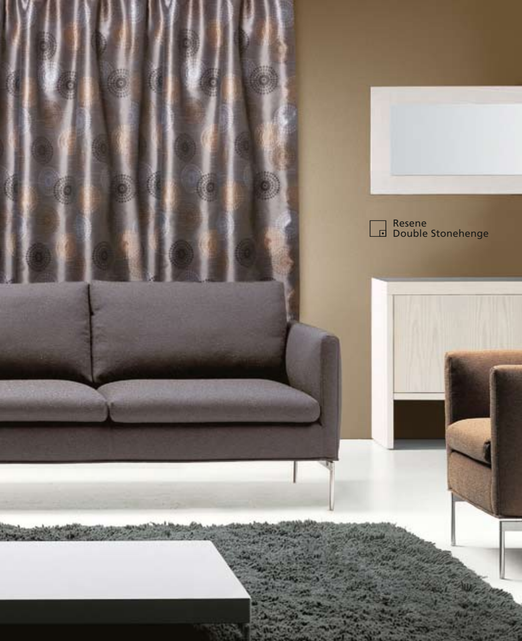
Resene Double Stonehenge

Far left Resene Curtain Collection Diva: Stunning sheen effect with European-inspired woven contemporary design.