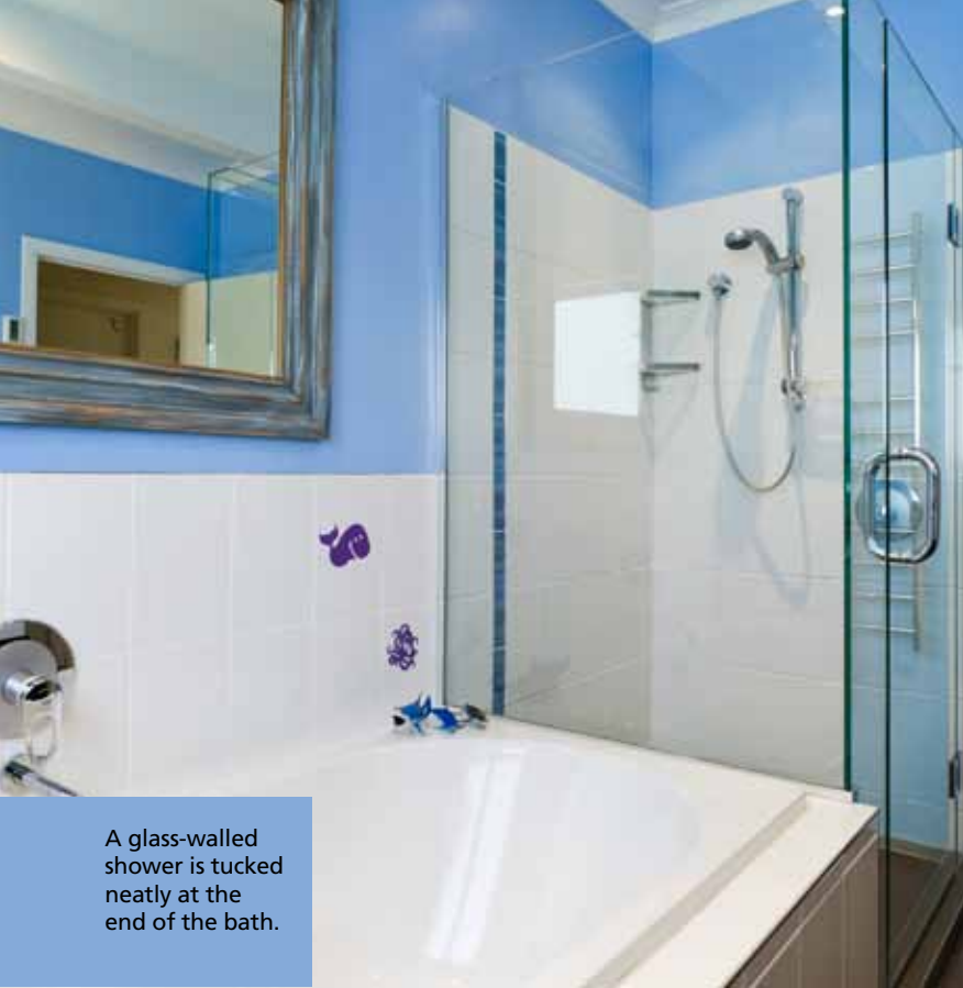
A glass-walled shower is tucked neatly at the end of the bath.

Cara also had some fish wall hangings that tied into the colour scheme so they promptly went up in a corner. To further unite the scheme, Anna specified blue glass tiles, called Denim Thread, from Designa Ceramic Tiles which pull the blue tones of the walls through into a playful strip that slices through the white tiles of the shower. Tiles in a pale earthy colour are a practical covering for the floor.