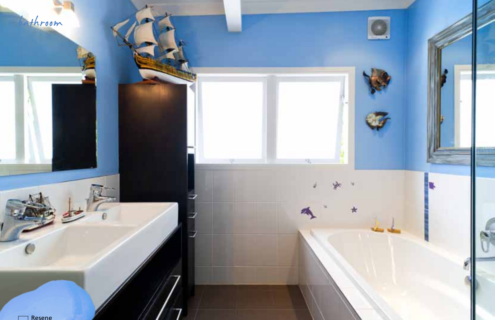
Resene Jordy Blue