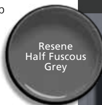
Resene Half Fuscous Grey