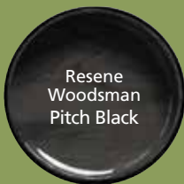
Resene Woodsman Pitch Black