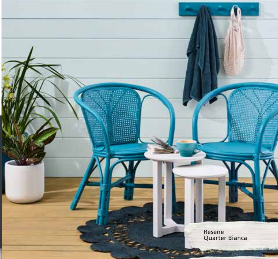
Resene Quarter Bianca