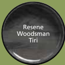
Resene Woodsman Tiri