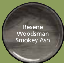
Resene Woodsman Smokey Ash