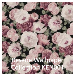
Resene Wallpaper Collection KEN001

Tropical hibiscus, cherry blossoms, darling daisies and old English roses – whatever the season, the Resene Wallpaper Collection is always in full bloom. Today's designs are nothing like the garish flowered wallpapers of previous generations. No shrinking violets, these beautiful blooms will add instant romantic charm and glamour to a room. Pair with bold Resene paint colours such as Resene Arthouse and Resene Midnight Express to amp up the drama.