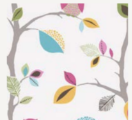
Resene Wallpaper Collection 8563-26