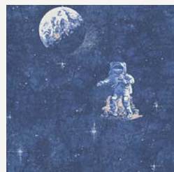
Resene Wallpaper Collection 30489-1