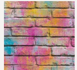
Resene Wallpaper Collection 36100-1