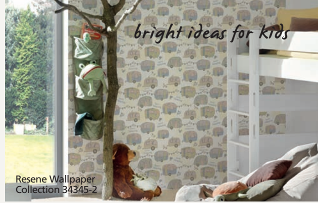
Resene Wallpaper Collection 34345-2

projects Sarah Kolver, Leigh Stockton