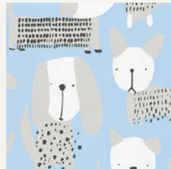
Resene Wallpaper Collection 36755-1