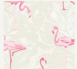
Resene Wallpaper Collection 35980-1