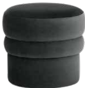
illustration Malcolm White