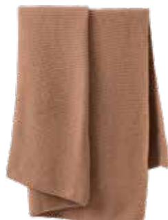
illustration Malcolm White