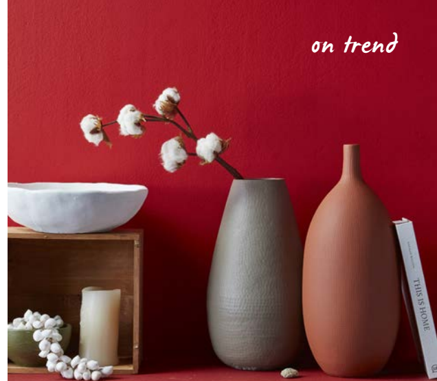
Above: The box is stained Resene Colorwood Natural, the bowl is Resene Elderflower and the vases are in Resene Double Pravda and Resene Moccasin.