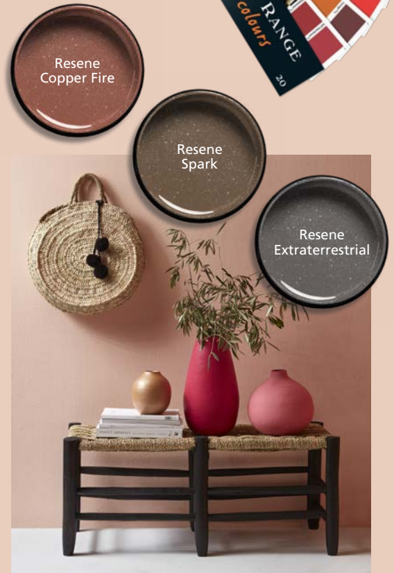
Above: Resene FX Metallic Rose Gold, used to paint this small vase, is one of Resene's newest metallic hues. The trend for metallics this season stays warm and burnished rather than silvery and glitzy. Think brass, dulled copper and antique gold. Other metallic paint colours to try are Resene Copper Fire, Resene Spark and Resene Extraterrestrial. See the Resene Metallics & special effects colour collection for more metallic options.