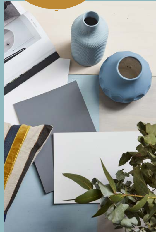
Above: Soft stains enhance the look. The background is in Resene Colorwood Whitewash, Resene Colorwood Greywash and Resene Raindance, the narrow vase is Resene Raindance, the wide vase is Resene Lazy River, and the A4 drawdown paint swatches are in Resene Poured Milk, Resene Quarter Baltic Sea and Resene Sea Fog. For other stains to try, see the Resene Colorwood range for interiors and the Resene Woodsman range for exteriors.

top tip The new Resene The Range fashion fandeck is supported by a range of tools to help you choose the right colour, from handy testpots to A4 drawdowns. See your local Resene ColorShop or reseller.