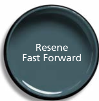
Resene Fast Forward