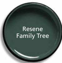
Resene Family Tree