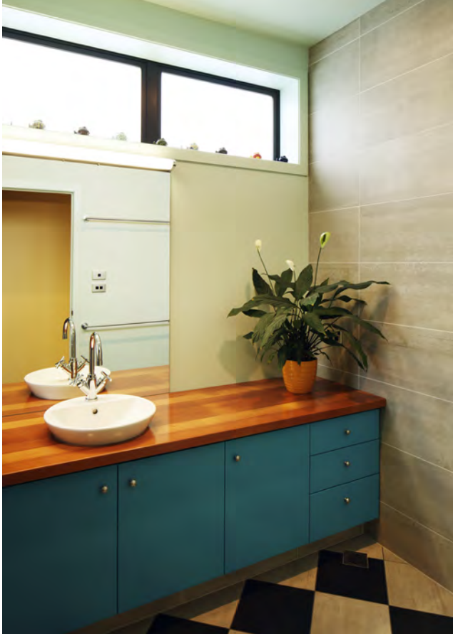
Above: The bathroom cabinetry is in Resene Hullabaloo, the wall in Resene Edgewater, the basin surrounded by American Cherrywood and floor tiles are laid in a chequered pattern.

will become a rumpus room in stage two so we were considerate of the area's ultimate use when choosing the palette. Richard made a clever suggestion. One wall is a wall of cupboard storage and he suggested painting some of the cupboard doors in Resene Moby and some in the wall colour to prevent the storage becoming too prominent."