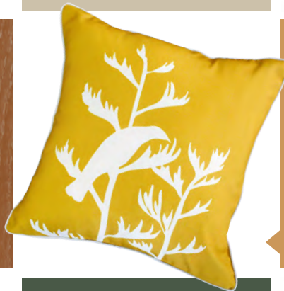
Mulberi Perching Tui in Golden Yellow Cushion Furtex www.furtex.co.nz 0800 333 456