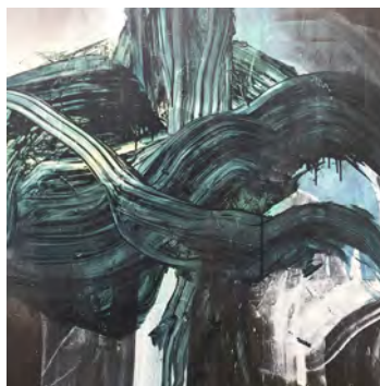
Resene Clay Creek