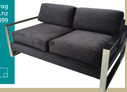
Resene Sea Crest

Anaglypta RD177 painted in Resene Thistle Resene ColorShops www.resene.com