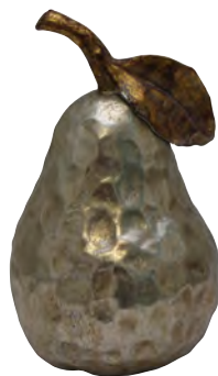
Silver Pear Ornament French Country Collections www.frenchcountry.co.nz 0800 503 500