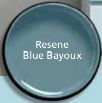
Resene Blue Bayoux

Above: Go with the flow with this squiggle design. The flowing motion of painting the squiggles is relaxing in itself. Wall in Resene Grey Seal (try Resene Quarter Stack) with painted swirls in Resene Mystery (try Resene Half Escape) and Resene Remember Me (try Resene Freestyling) and chest of drawers in Resene Remember Me.