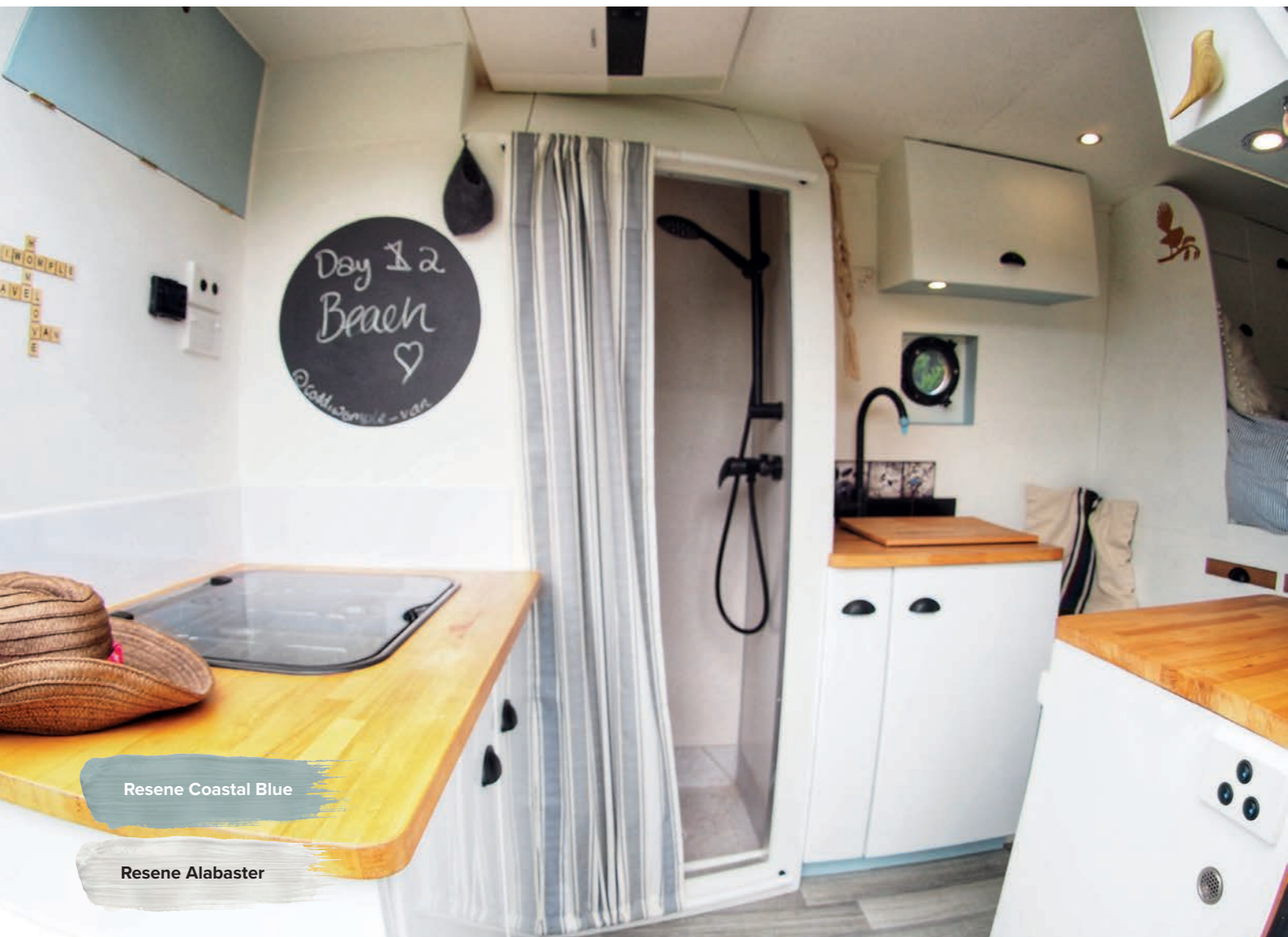
Resene Coastal Blue