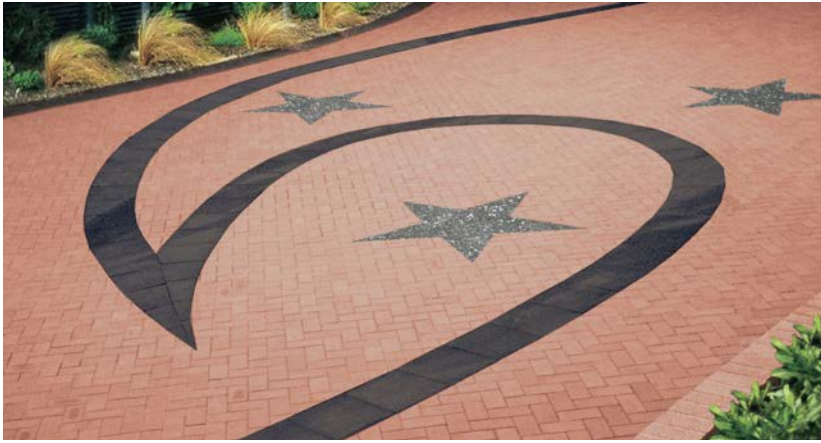
above: Resene Concrete Stain in Resene Black was used to create the sharply contrasting swirling motif on this paving in Resene Concrete Stain Red Terracotta.