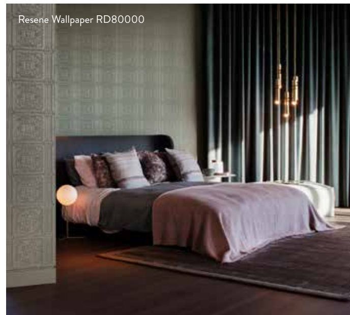
Resene Wallpaper RD80000

“The bathroom in the first apartment I bought was surrounded by internal walls with no method of ventilation, so the unrelenting moisture made a dog’s breakfast of the ceiling. When I fixed it, I opted for a similar Anaglypta wallpaper design to this one painted misty grey like Resene Ghost and it made the space feel so glamorous. Now, Anaglypta designs are my go-to for tricky plasterboard walls that still require textural distraction when even proper prep work doesn’t suffice. Resene Anaglypta Wallpaper comes in a wide range of designs that you can paint in any colour you please, making it the superhero of wallpapers in my eyes. Try painting yours in Resene Spanish Green for a similar look to this bedroom.”