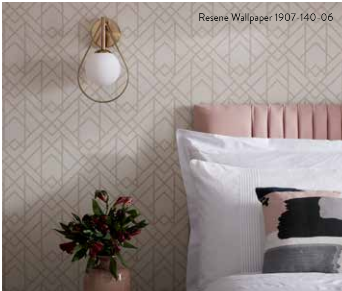
Resene Wallpaper 1907-140-06