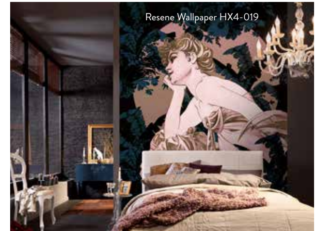
Resene Wallpaper HX4-019