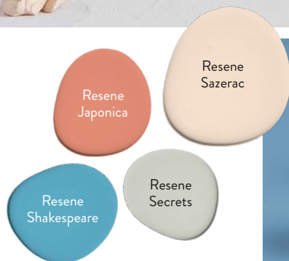
right: Signs of more optimistic hues are beginning to surface. Background in Resene Shakespeare with plaster jellies in Resene Japonica, Resene Dark Knight, Resene Cashmere, Resene Bone, Resene First Light and Resene Secrets.