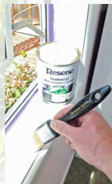
Step eight Paint the woodwork with two coats of Resene Alabaster, allowing two hours for each coat to dry. Carefully remove the masking tape before the paint dries.

If you've just had new white windows fitted, it's easy to transform the bare wooden sills and surrounds with a matching clean white finish.