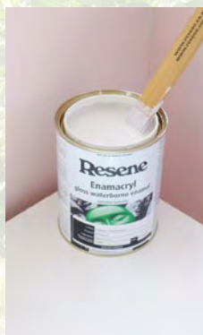
Step seven Stir the Resene Enamacryl with a paint stirrer.