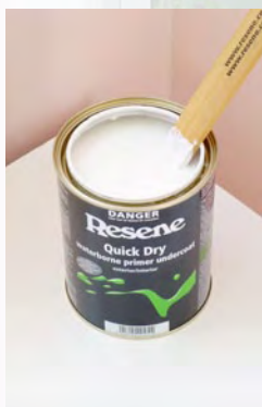
Step five Stir the Resene Quick Dry with a paint stirrer.