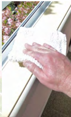
Step three Wipe off any sanding dust with a clean cloth.