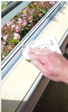
Step two Lightly sand the filled nail holes, as shown.