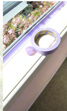
Step four Carefully mask off the window frame and surrounding wall with low tack masking tape.