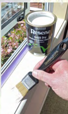
Step six Apply one coat of Resene Quick Dry to the bare wood and allow two hours to dry.