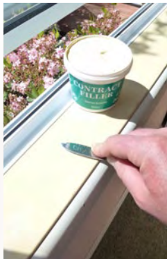
Step one Fill any nail holes with wood filler and allow to dry.